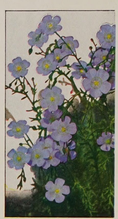
LINUM perenne (Flax)